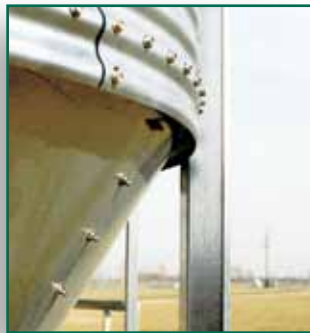
Drip edge directs moisture away from the taper hopper.