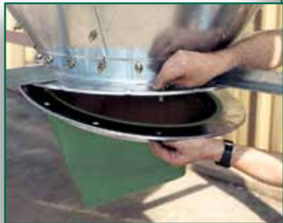
Boot attachment with the VAL-CO split collar allows for fast, easy installation.