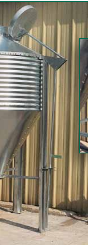
Above, the VAL-CO pinch-lock lid opener is easy to operate.