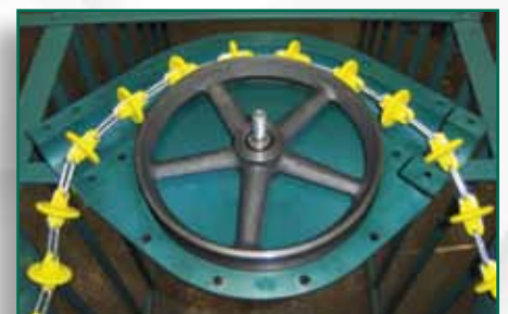
Opened corner unit with chain