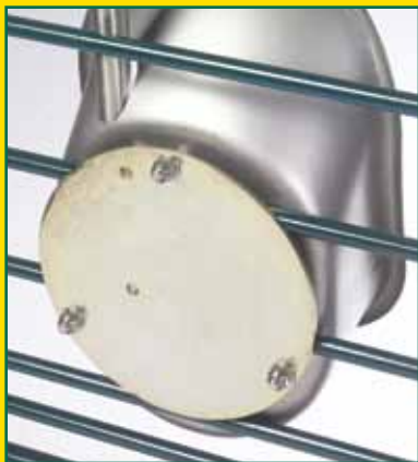
Our mounting bracket holds the drinker securely in place.