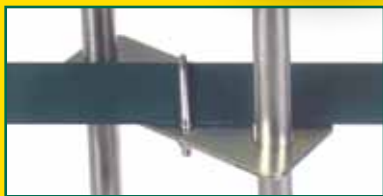
Top Gate Bracket