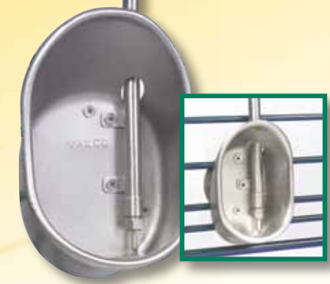
Hog drinking cups that reduce spillage by as much as 40%