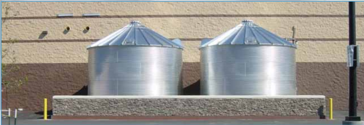
35,600 Gallons each (134,760 L) Water Storage Tank