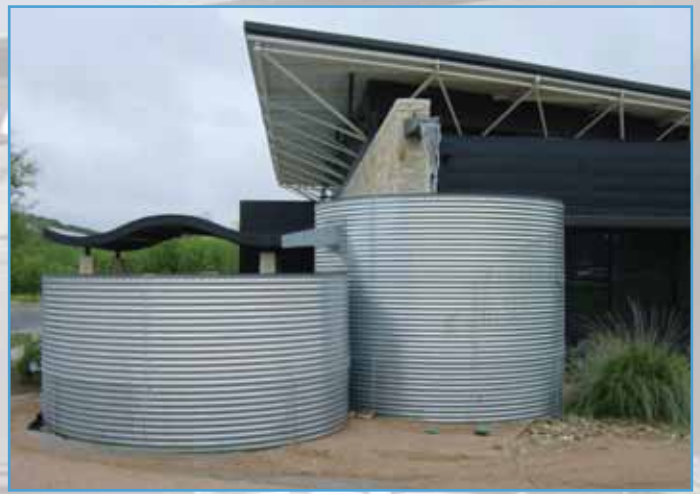
Water Storage Tanks are designed to meet custom needs