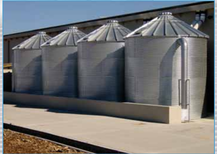
18,100 Gallons each (68,515 L) Water Storage Tanks for rain water collection