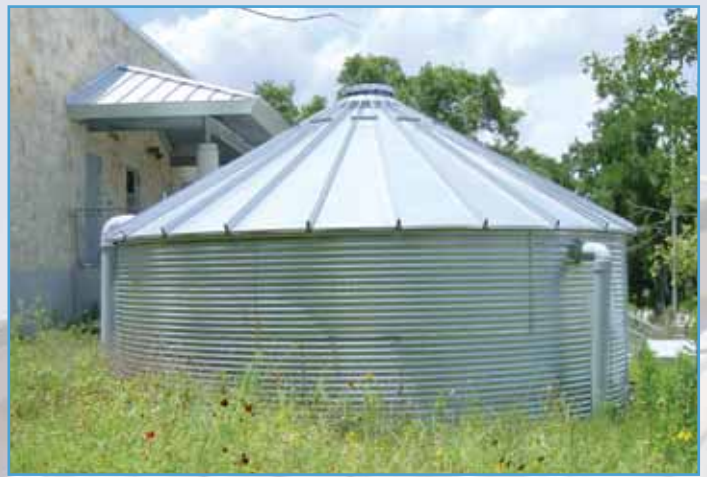
17,300 Gallon (65,490 L) Water Storage Tank for residential use