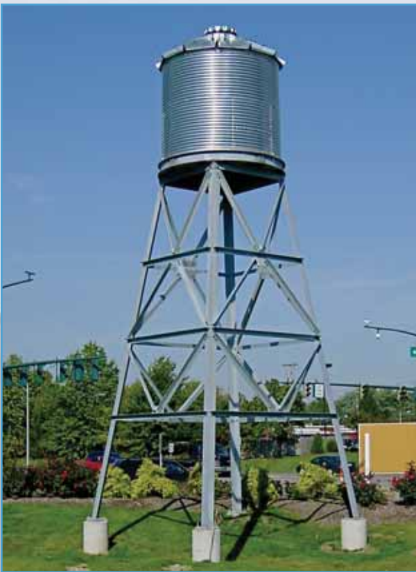
Overhead Water Tank mounted on tower